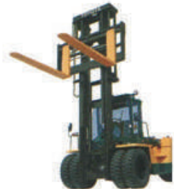
15 ton Forklift