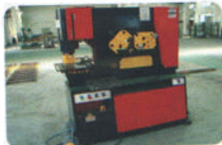
Hydraulic Punch Machine