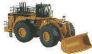
CAT 994F Front Wheel Loader