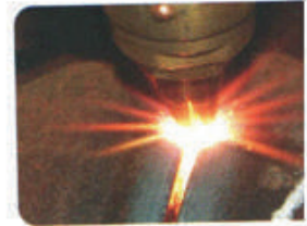
CNC Plasma Cutting Machine