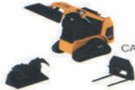
CAT Multi-Terrain Loader With W Tools Die-Cast Collectible