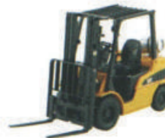
CAT Die-Cast Collectible