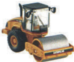
CAT CS-563E Smooth Drum Vibratory Soil Compactor