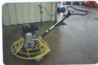
Concrete Power Trowel